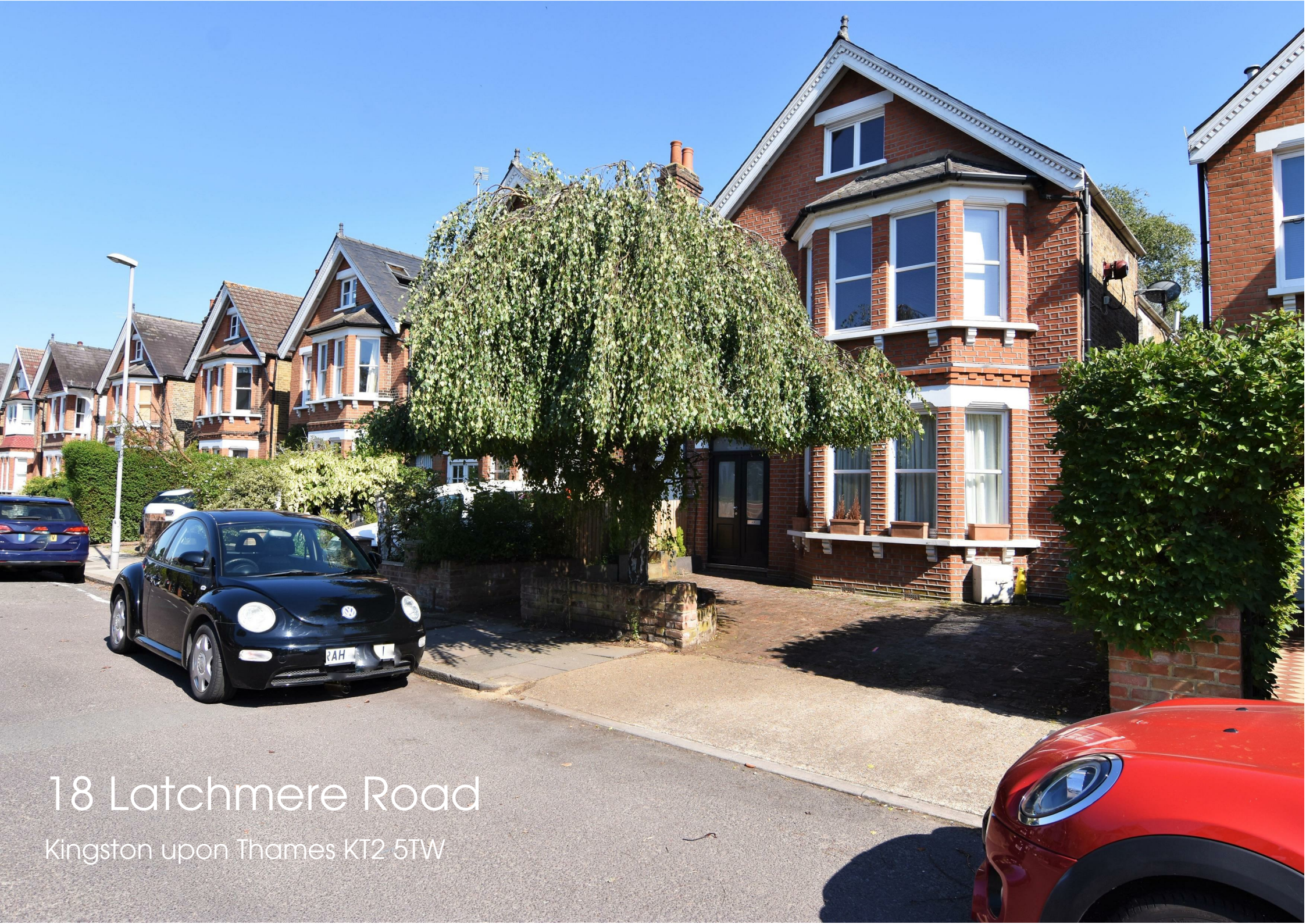
18 Latchmere Road Kingston upon Thames KT2 5TW

34 Richmond Road Kingston upon Thames Surrey KT2 5ED www.gibsonlane.co.uk Tel: 020 8546 5444